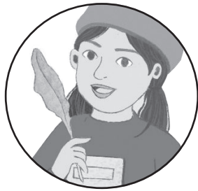
2 Naomie OR Layla