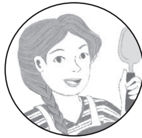
3 Steph OR Talia