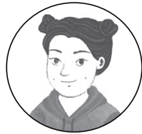
4 Rhiannon OR Rosie